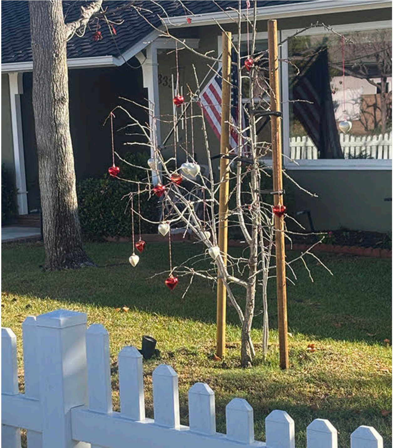
But then in the same yard I saw this tree: