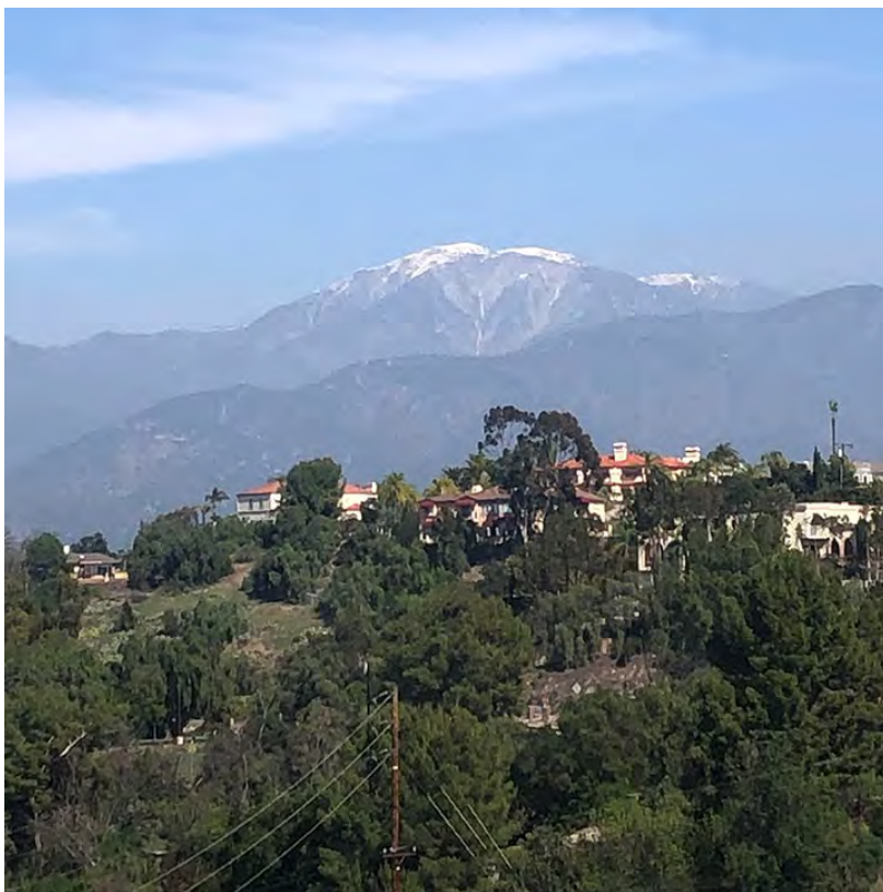
The view on this ride that last time we rode it in February

Thursday, February 20 – 8:30 a.m. TRIPLE DIPPER SOUTH BAY RIDE -- See February 6th for details.