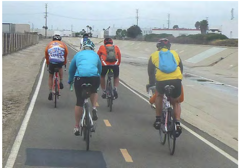
The group riding Coyote Creek on Long Beach Boogie

Thursday, February 6 - 8:30 a.m. TRIPLE DIPPER SOUTH BAY RIDE Meet on the bridge at end of the Ballona Creek Trail in Marina Del Rey. Riders usually go south to Palos Verdes on the bike path and then do some riding on the Peninsula. There are optional climbs including the 3 "dips" which give the ride its name. The group usually stops for a break at the Golden Cove shopping area. Occasionally the group will decide to vary the route and explore specific sites elsewhere in the city. A typical day is 40 - 50 miles but often individual riders either cut the day short or add extra miles as desired. Contact Lewis Singer lewissinger@gmail.com for details.