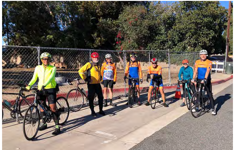
Ride start in 2022 before Pine Tree Park was renovated. It's much nicer now

Thursday, December 5 – 8:30 a.m. TRIPLE DIPPER SOUTH BAY RIDE Meet on the bridge at end of the Ballona Creek Trail in Marina Del Rey. Riders usually go south to Palos Verdes on the bike path and then do some riding on the Peninsula. There are optional climbs including the 3 "dips" which give the ride its name. The group usually stops for a break at the Golden Cove shopping area. Occasionally the group will decide to vary the route and explore specific sites elsewhere in the city. A typical day is 40 - 50 miles but often individual riders either cut the day short or add extra miles as desired. Contact Nancy Domjanovich nancydomx@icloud.com for details.