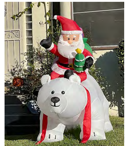
One of the many inflatables you may see on today's century

(Century 92 mi & 3700 ft, Metric Century 66 mi & 2400 ft, Half Century 51 mi & 1800 Ft. It is a well established December tradition now that our Centuries for the month are today's routes. This will be the 15 th consecutive year we have run this one and I have ridden every year. This year we are adding a half century to the mix. The century route itself is nothing extraordinary – a fairly urban route through the San Gabriel Valley, but there is a real holiday vibe to it that I like. The route passes Christmas tree lots in action; many houses have their decorations up; and holiday music can be heard as you pass many stores. I used to play a game to see how many cars I could count with Christmas trees on their roof and I always look forward to seeing what the latest thing in home