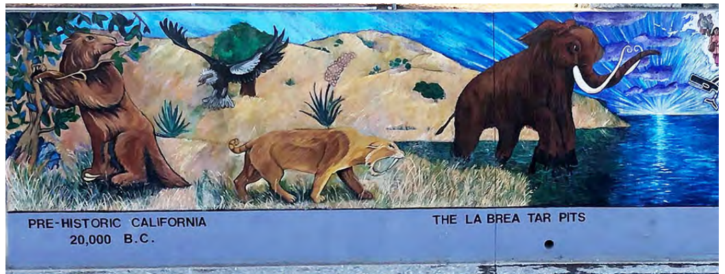
History mural in 2022 – but what is the animal on the left?