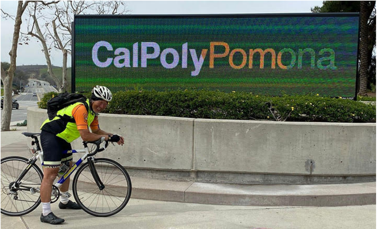
It was a nice day for riding. Still plenty of snow on the mountains as shown in the photo