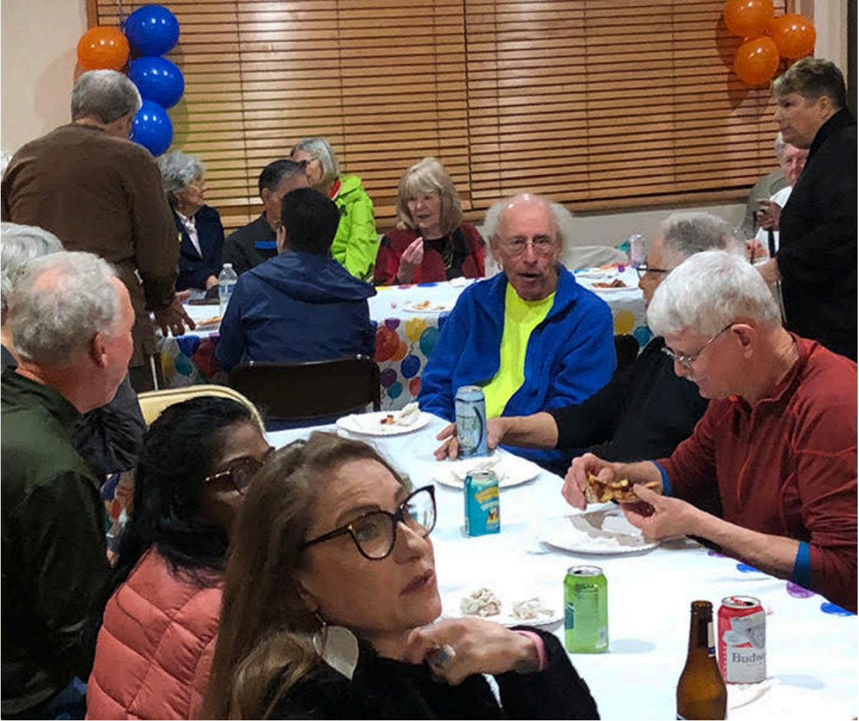
And of course the evening was topped off with cake: