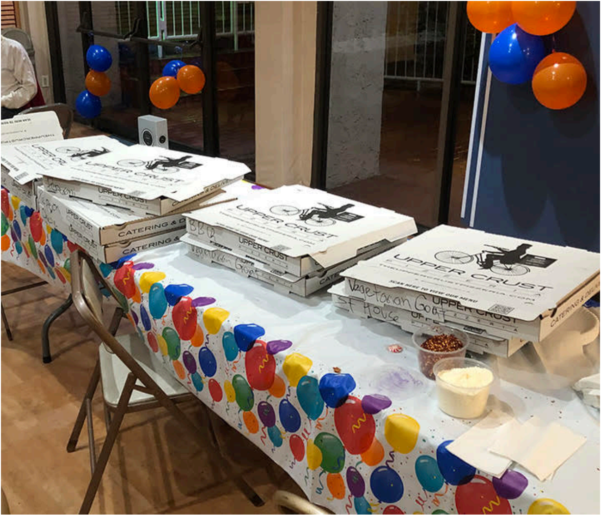
Leftovers were all taken home by party goers so they must have been a hit. Conversation was lively as we ate. I didn't get too many photos of the assembled crowd, but here is one: