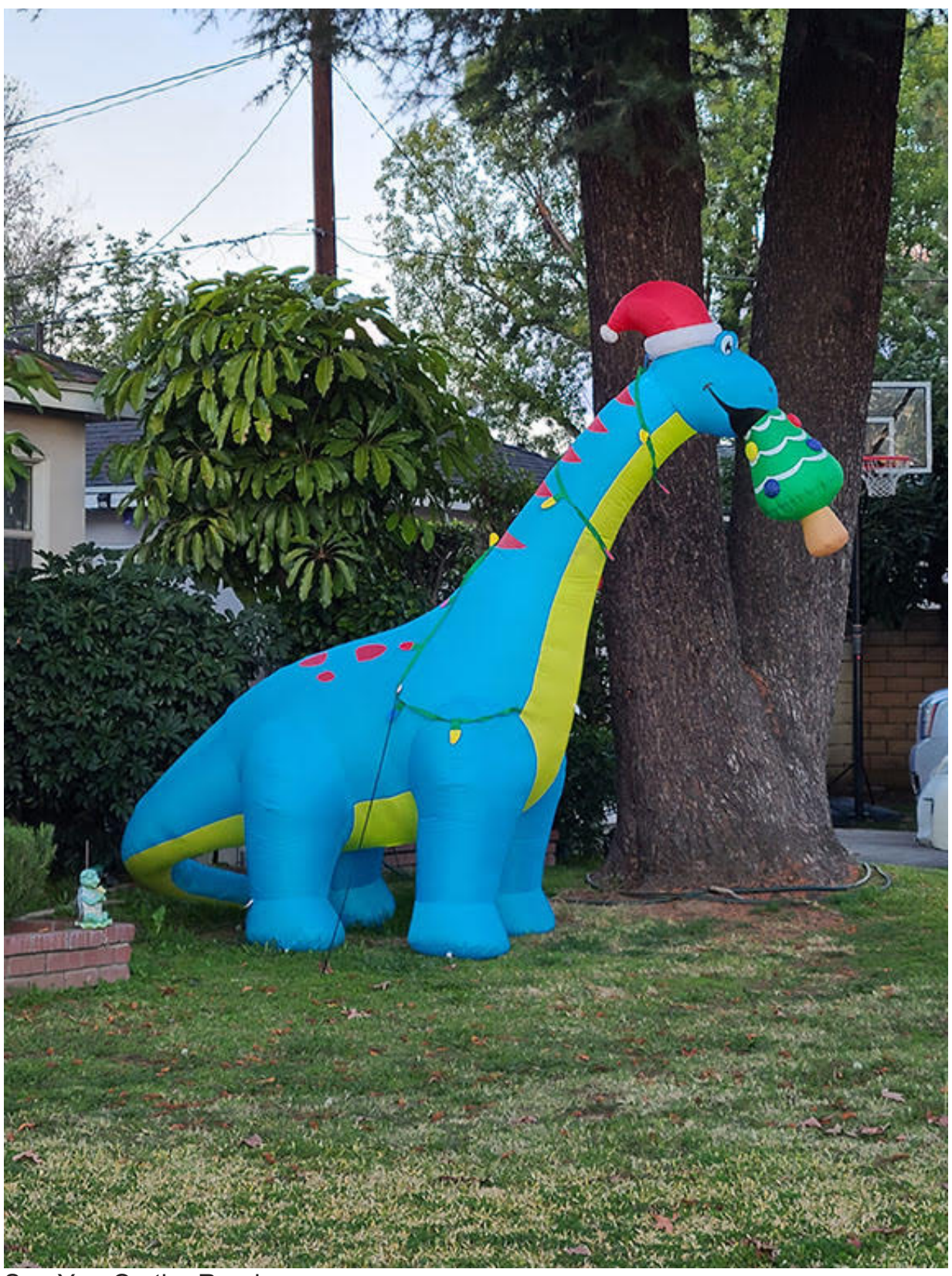
See You On the Road