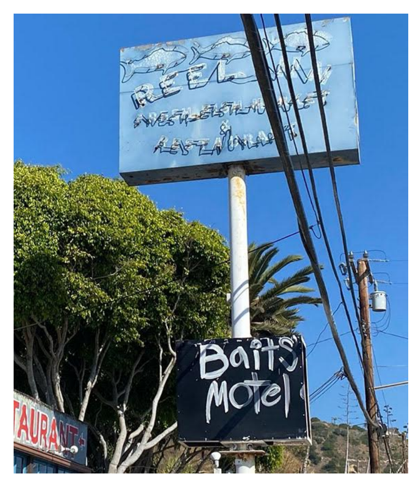
See You On The Road Rod Doty, VP