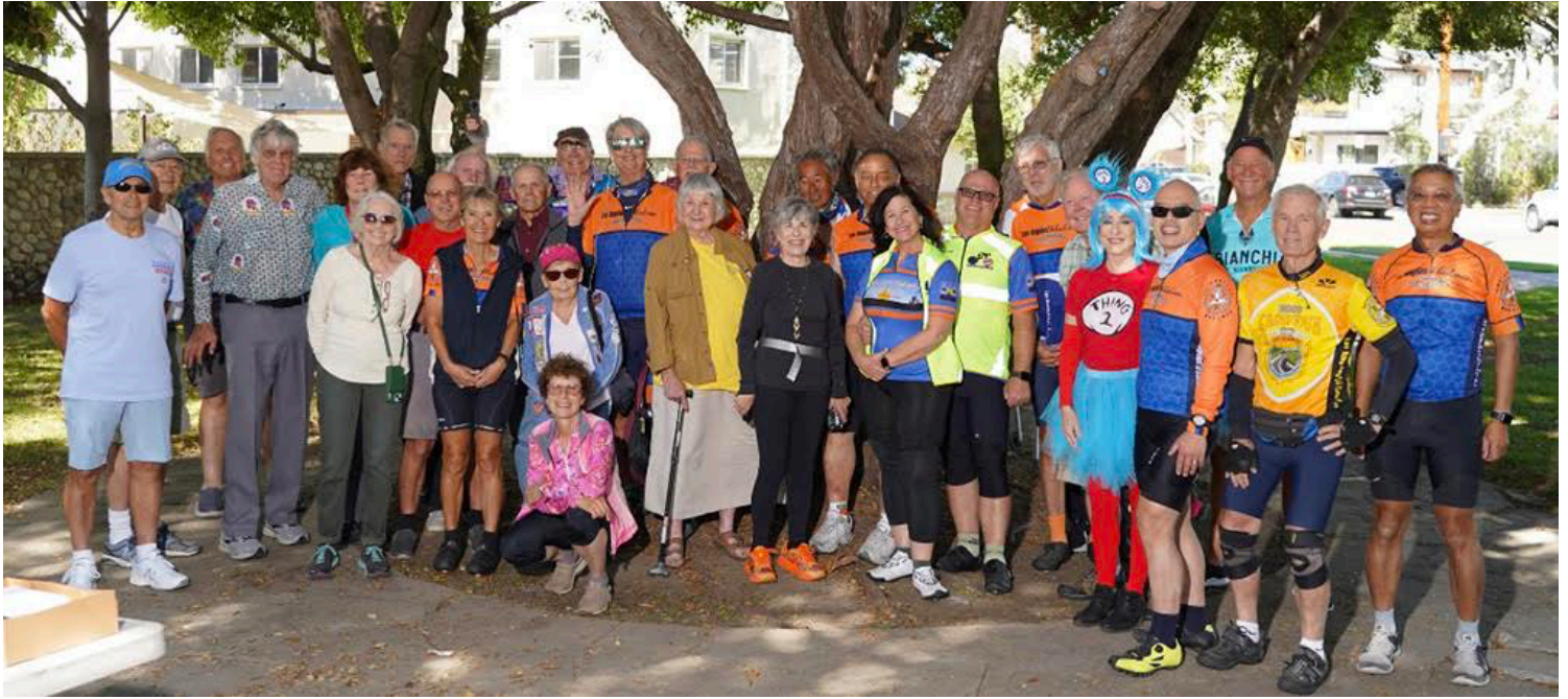
First up on the program was a nice lunch as shown here