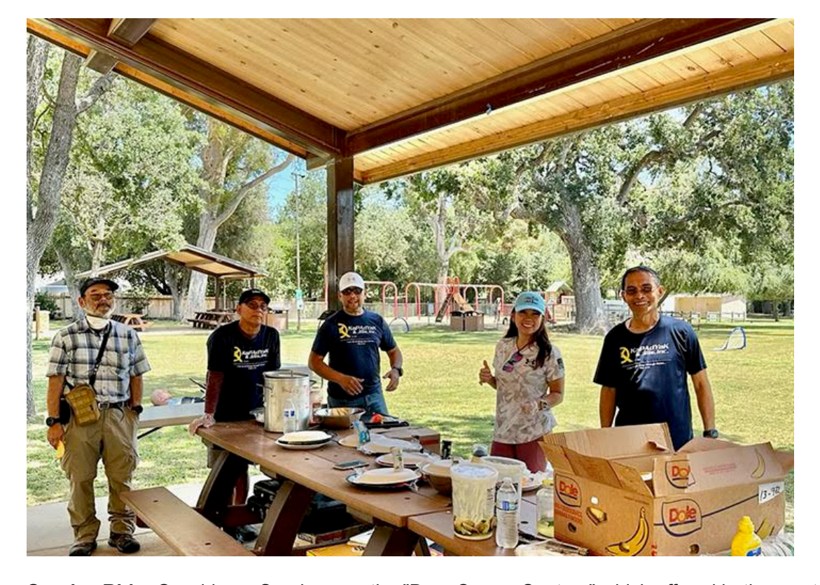
Sunday Ride: Our ride on Sunday was the "Dam Corner Century" which offered both a century and metric century. I