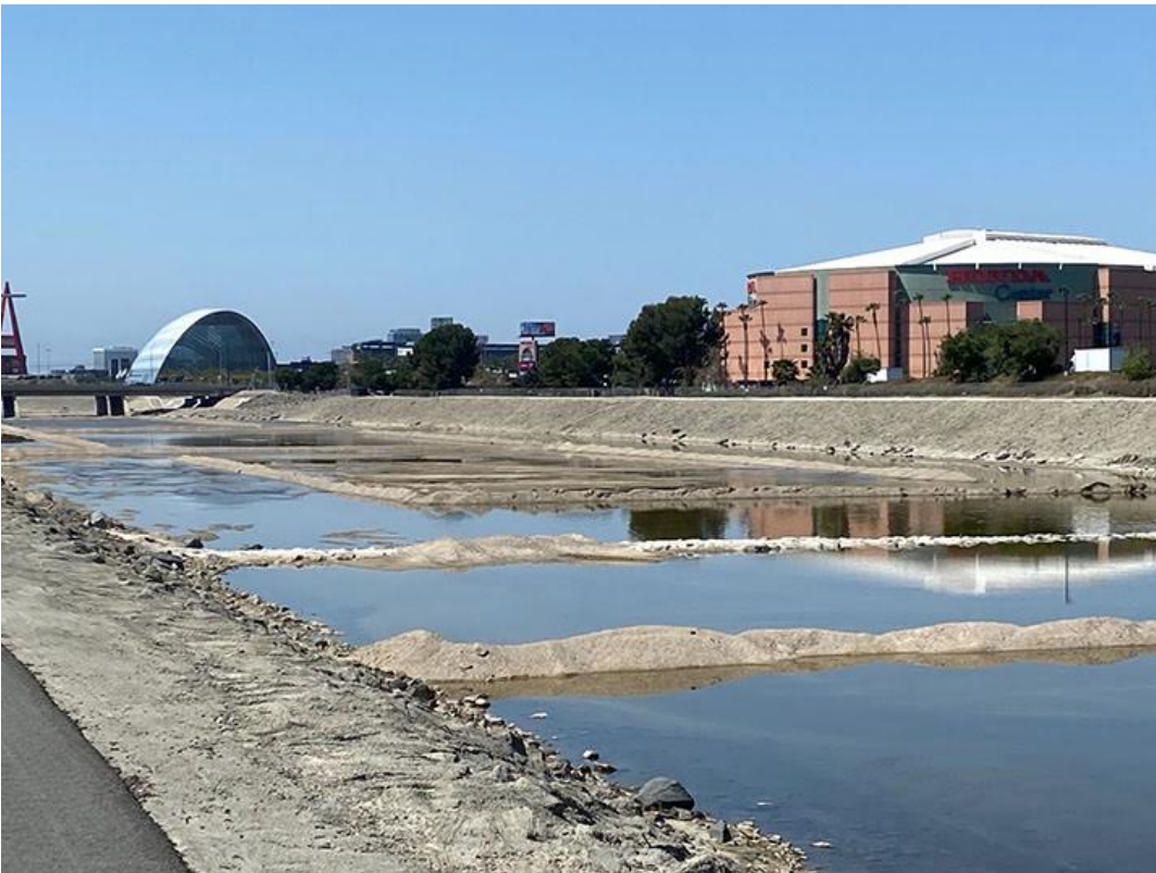
That's the Honda Center on the right, the Anaheim Regional Transportation Center to the left and on the far left, you