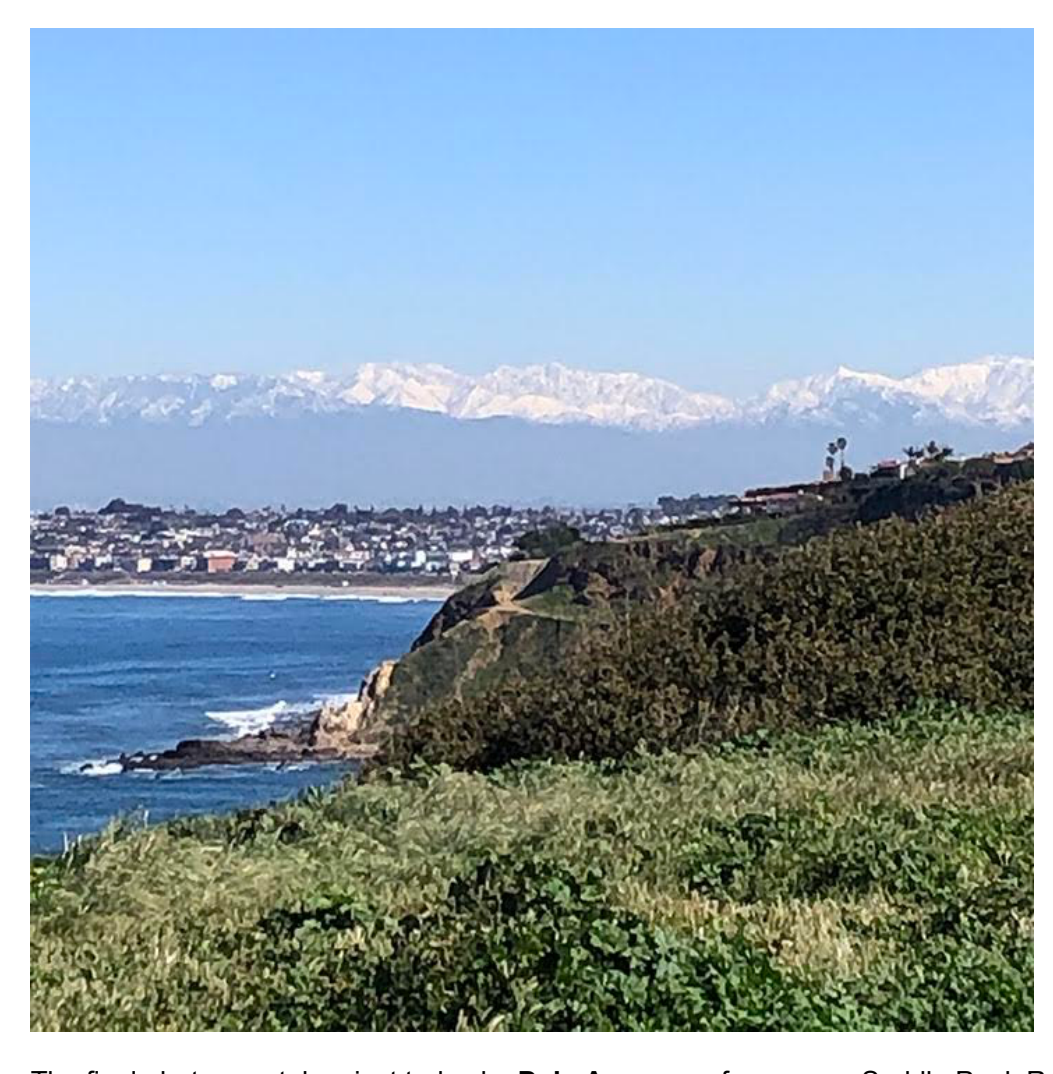
The final photo was taken just today by Dale Aaronson from up on Saddle Peak Rd.