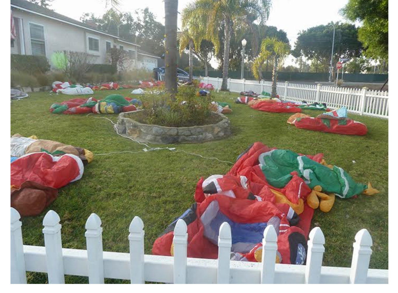
Looks like a regular bloodbath. Also looks like maybe some elves or maybe some Christmas trees got caught in the shootout as well.