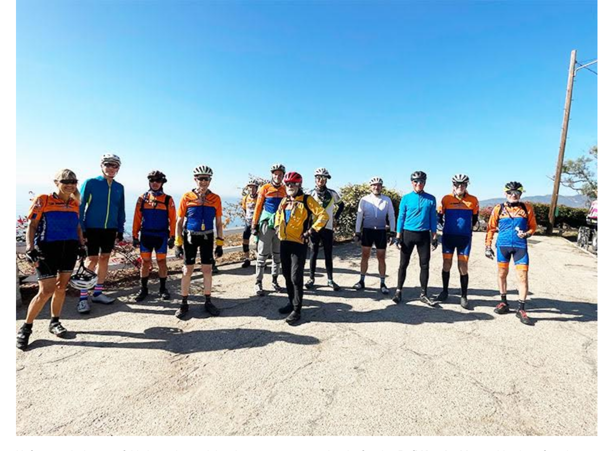
Unfortunately, it was a fairly hazy day and the view was not as good as it often is. Rafi Karpinski sent this photo from last year, but I saw the same decoration this year but at a different house in the same neighborhood.