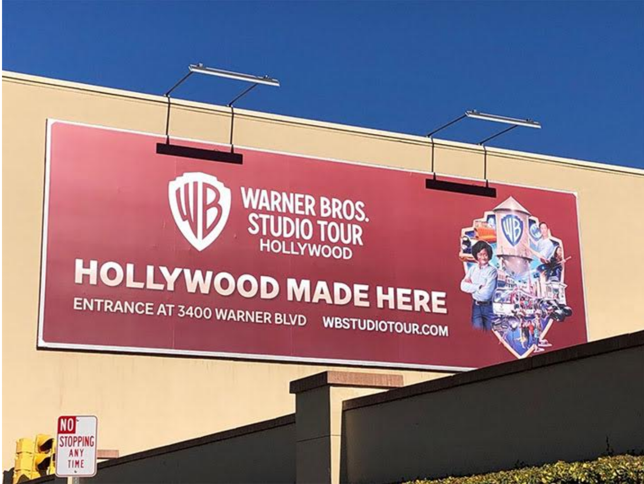
Dale sent this shot which shows that there are some fall colors, even in Southern California.