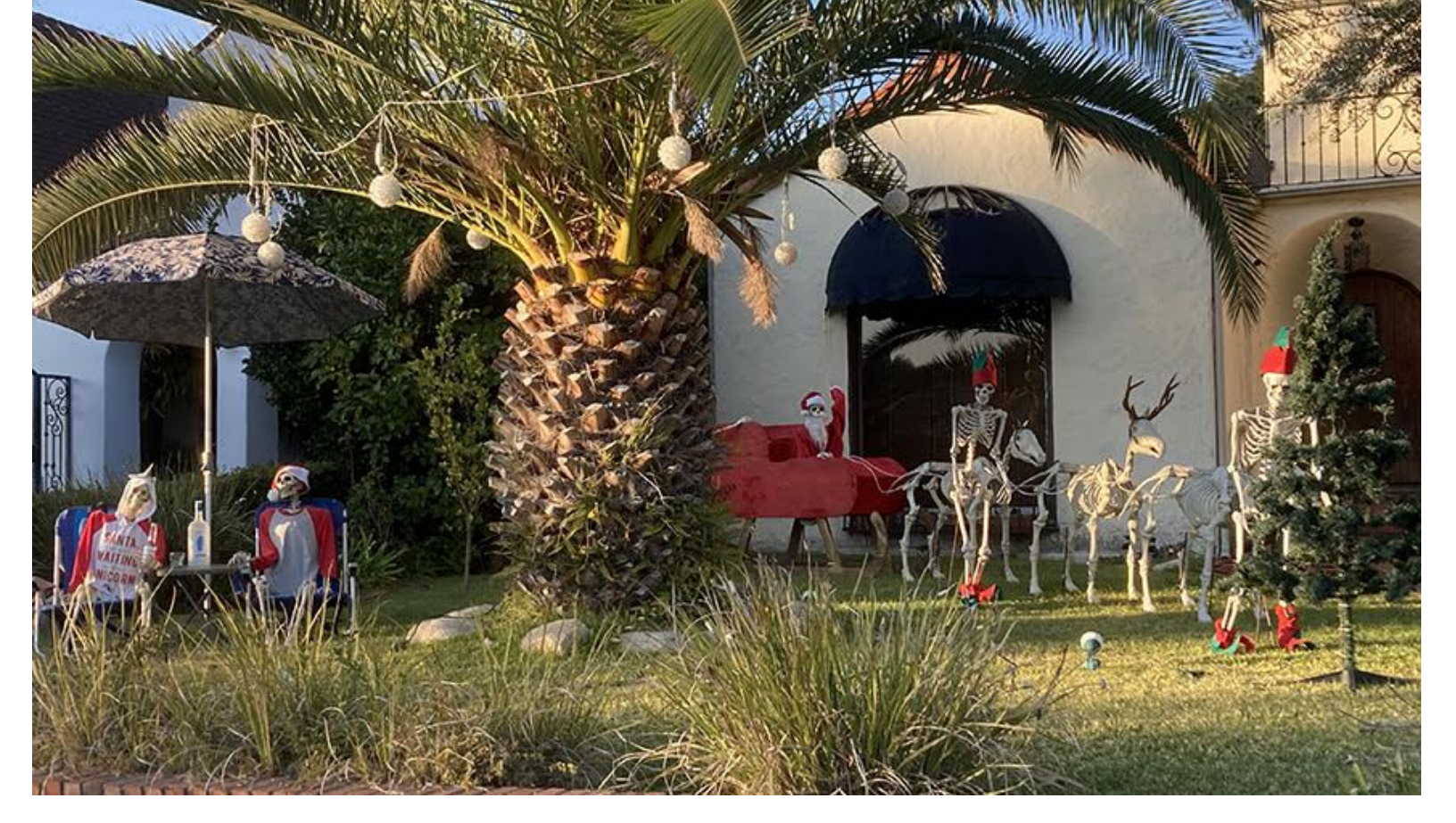
See You On The Road