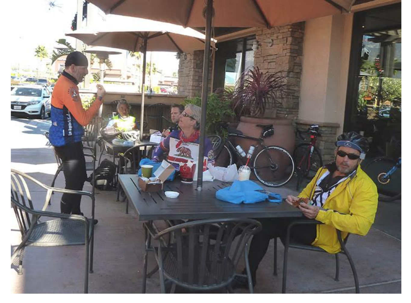
It was a cold day, but otherwise a very nice day for a holiday season century. I always enjoy seeing all the house decorations on this route which we always run in December. Here are a couple of decoration photos Rafi took