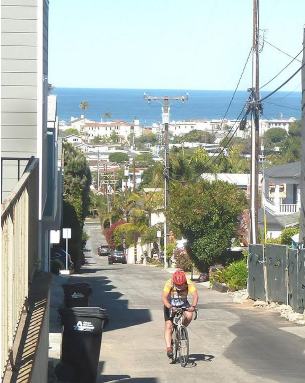
Of course, every climb has a downhill, so here we are enjoying one of those.