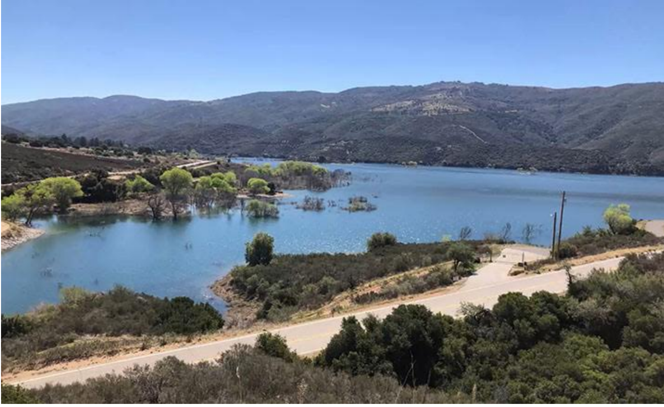
But this shot from Gary of Castaic Lake shows that it is down a bit from previous years.