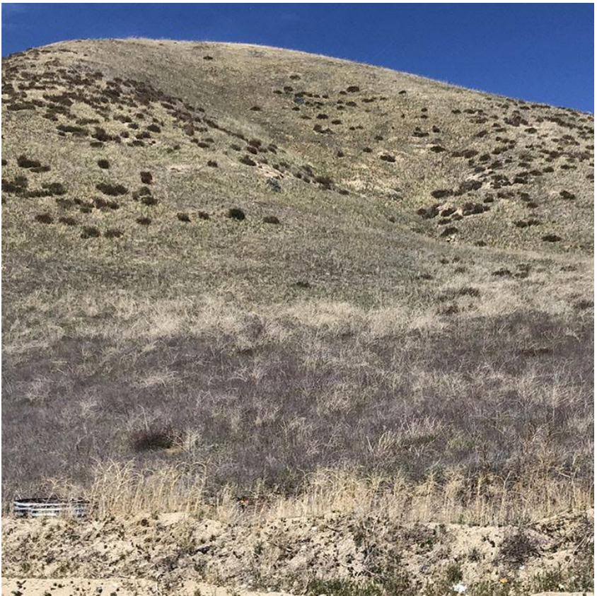
There were a few poppies. Gary took this shot of some: