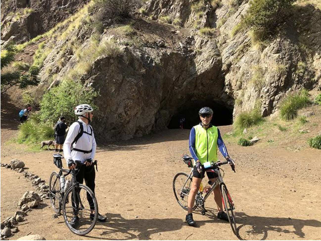
Later the route goes to the Observatory for lunch. Here's a photo from Phil