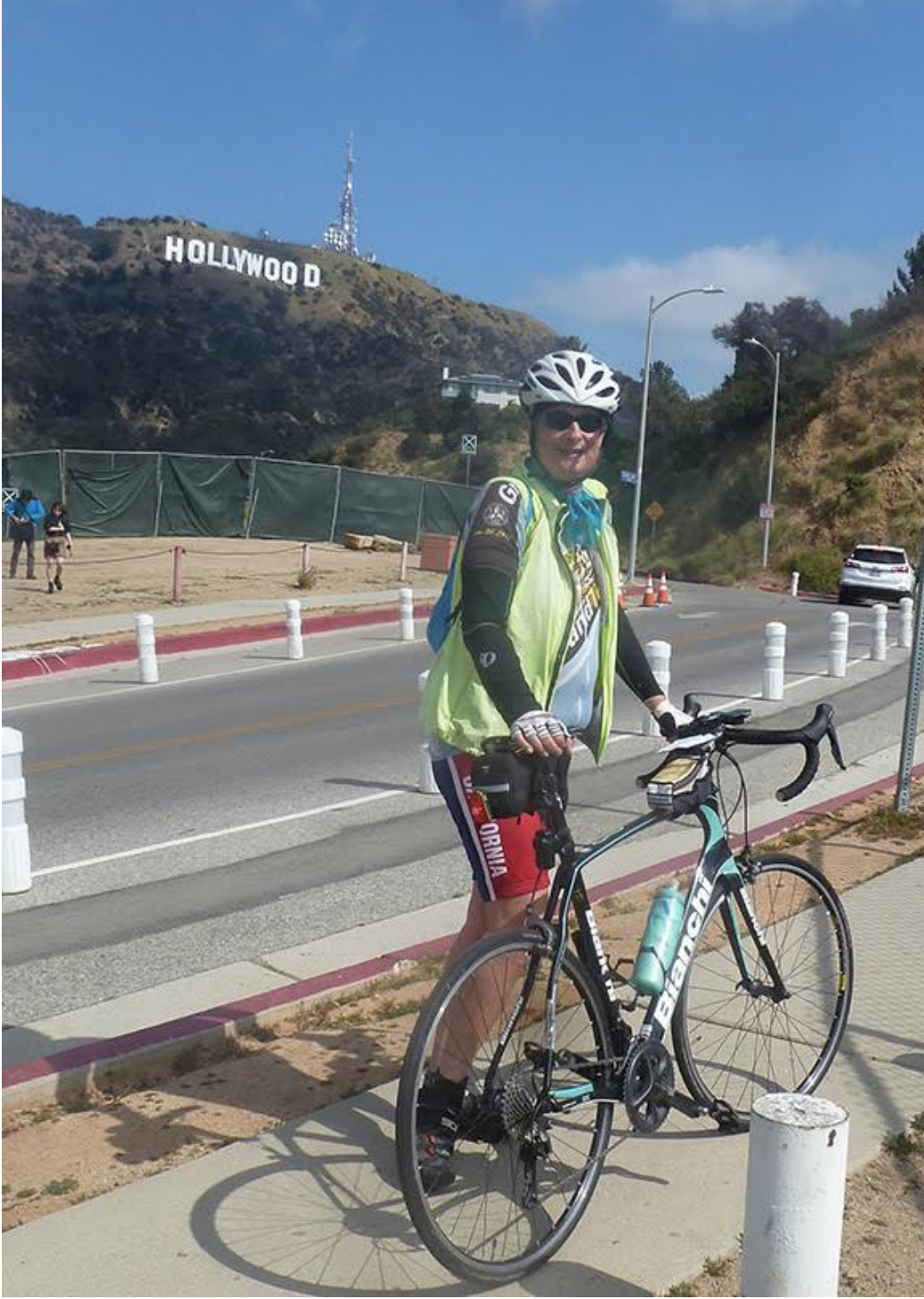
Looks like they installed some barriers to keep the tourists from parking at the top. The highlight of the day is of course the caves. Here is a photo from Phil