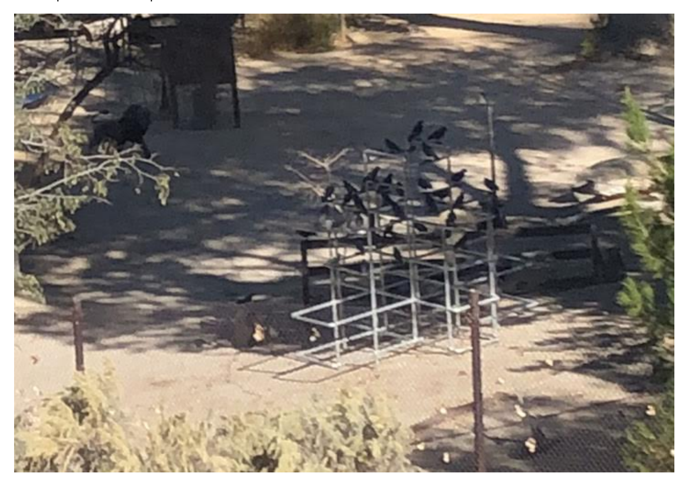
It's a jungle gym with a bunch of crows perched on it. It would appear to be a re-creation of a scene from Tippi Hedren's most famous movie -- "The Birds." The first time we saw it, I think we thought they were real birds, but since they are there every time we go by, I guess not.

We had lunch at the Halfway House Cafe, which appeared to have barely escaped the recent Santa Clarita fire. In the cafe they had two TVs going. One was showing a football game and the other appeared to be showing a movie. As I watched the movie, I realized that the scene I was watching