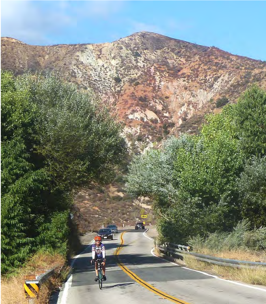
That's Jacques, somewhere on San Francisquito Canyon.

Two of the riders cut the route a little short by riding Spunky Canyon over to Bouquet Canyon and skipping the trip to Leona Valley. The rest completed the ride. It was really a nice day to be out in those canyons. A day or two after a rain is almost always a nice time to ride. The air was clean and it smelled like autumn. Gary sent me a few photos: