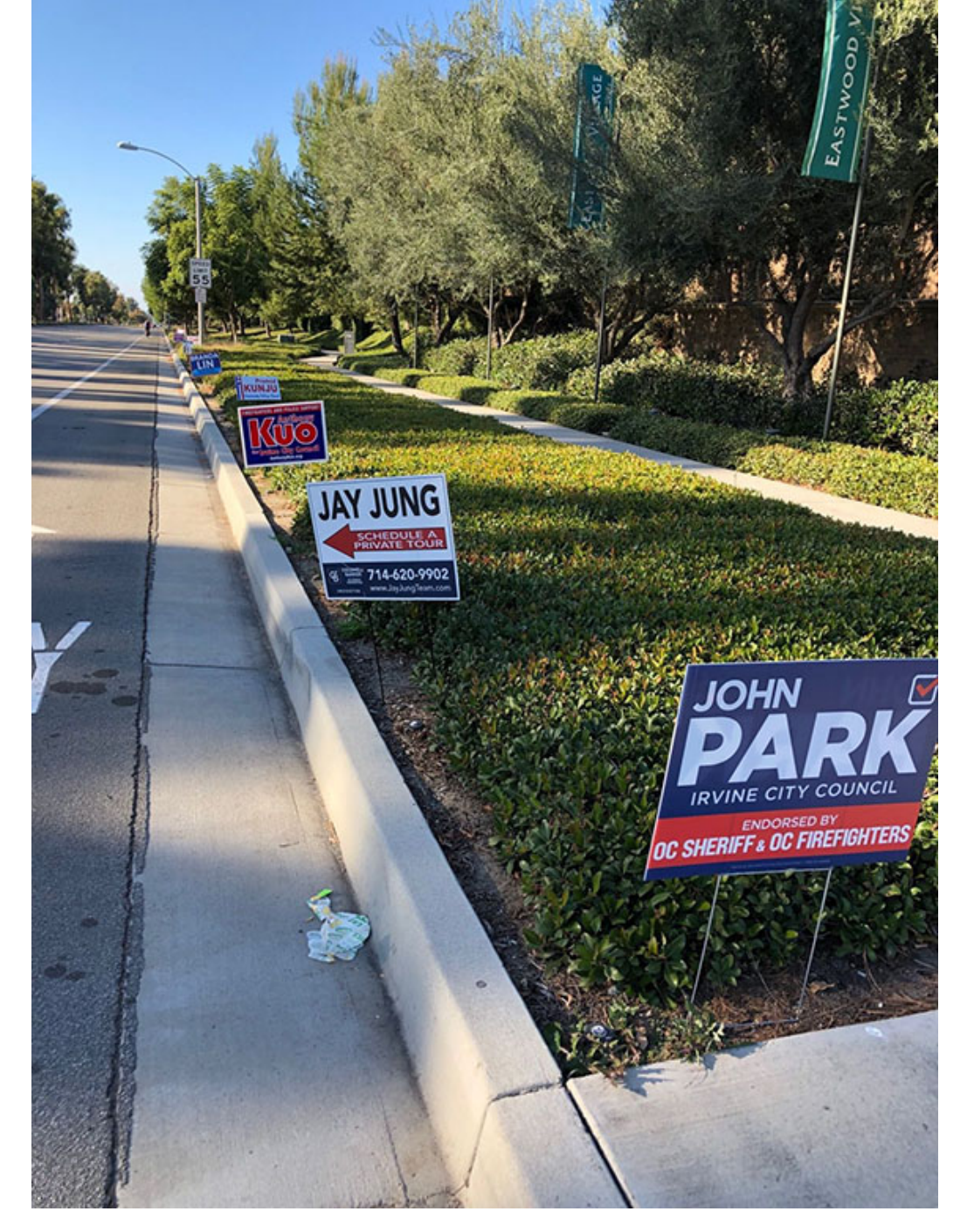
I took a shot of this one because it was another "anti" sign, which is sort of a new phenomenon this year. As I said before, I think it marks a loss of civility in local elections