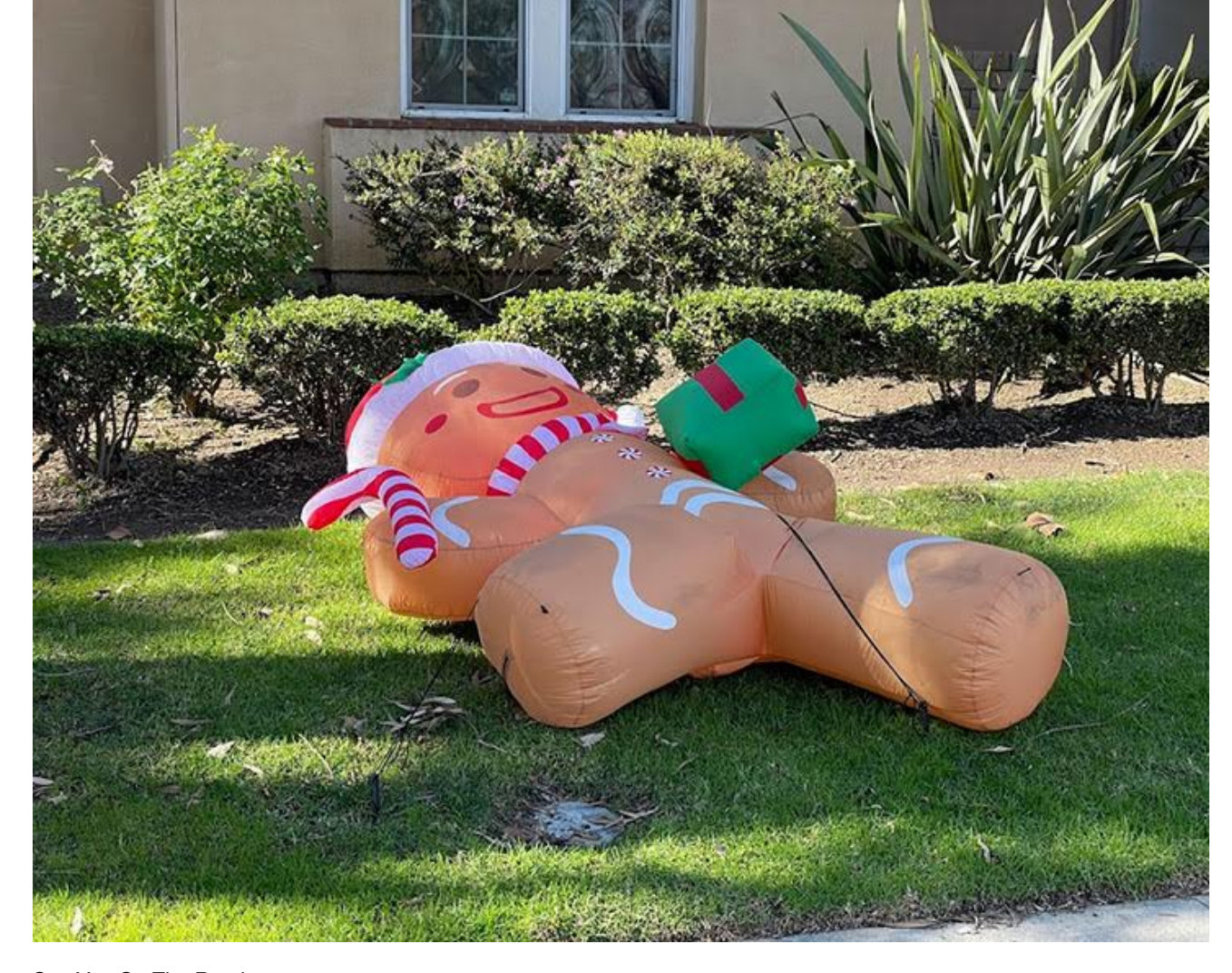
See You On The Road Rod Doty, VP