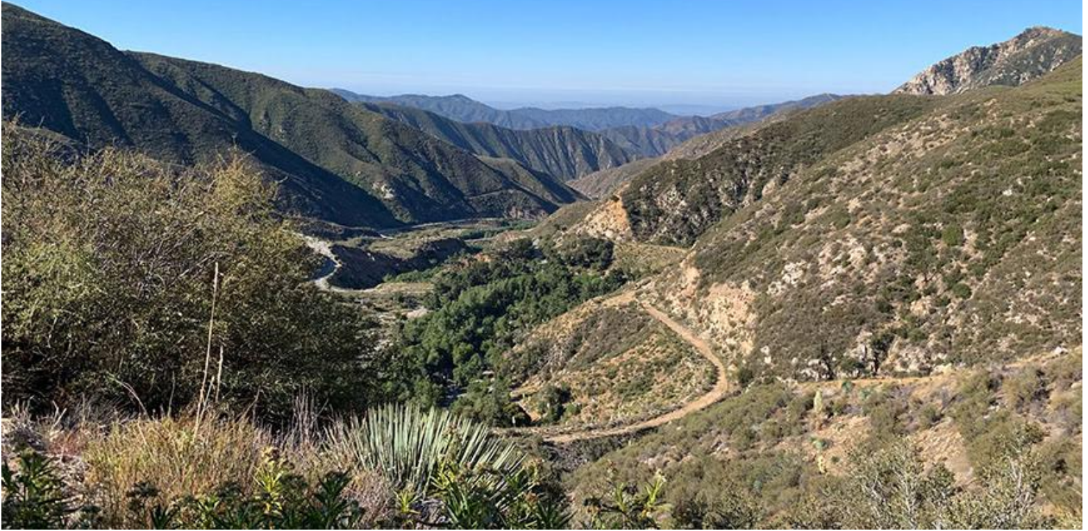
Gary took this photo of all the Yucca plants in bloom in the canyon