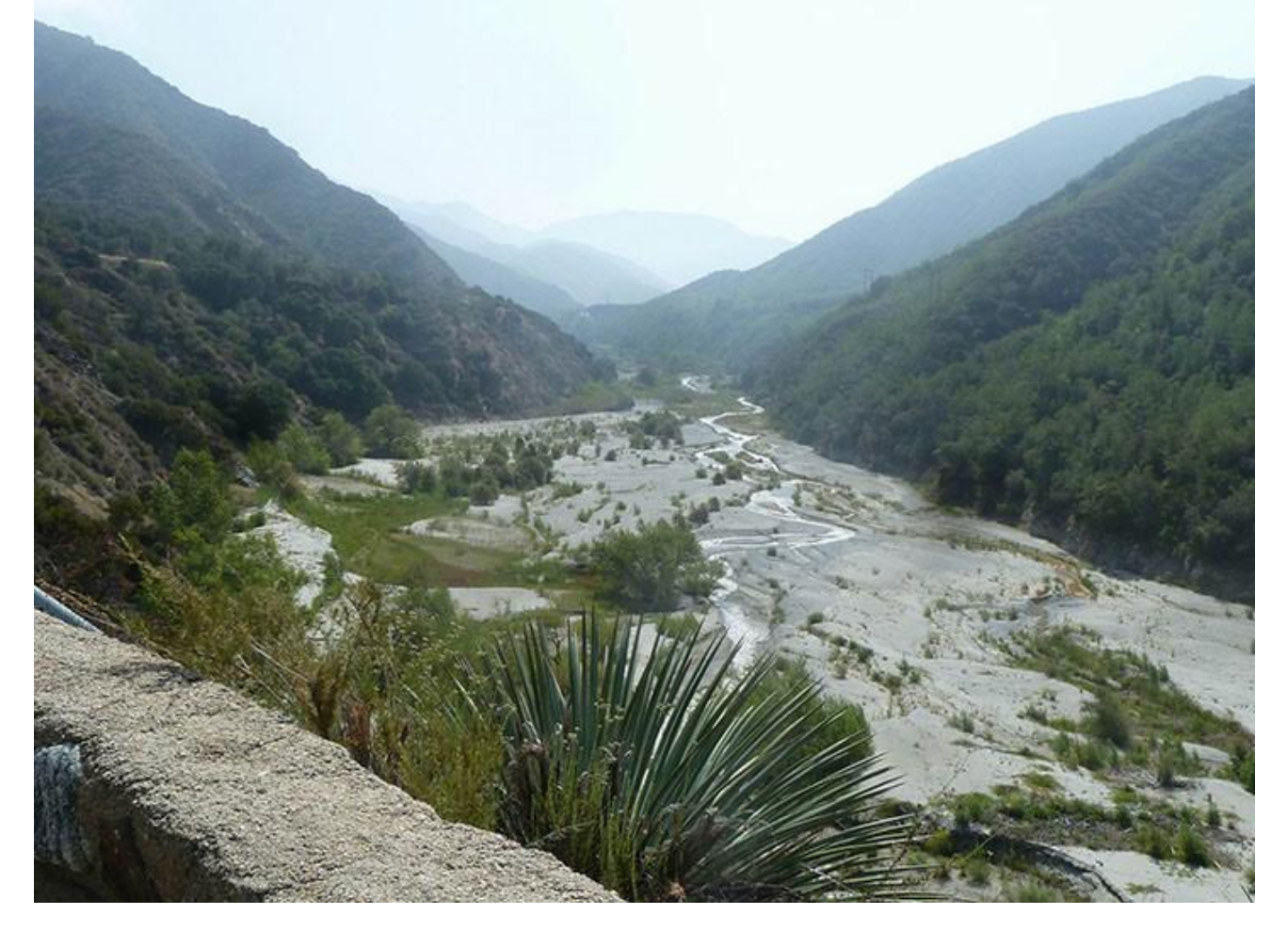
I took this photo of the Morris Reservoir (the one below the San Gabriel) from up on Glendora Mountain Road. It also shows that the water level is fairly low for this time of year.