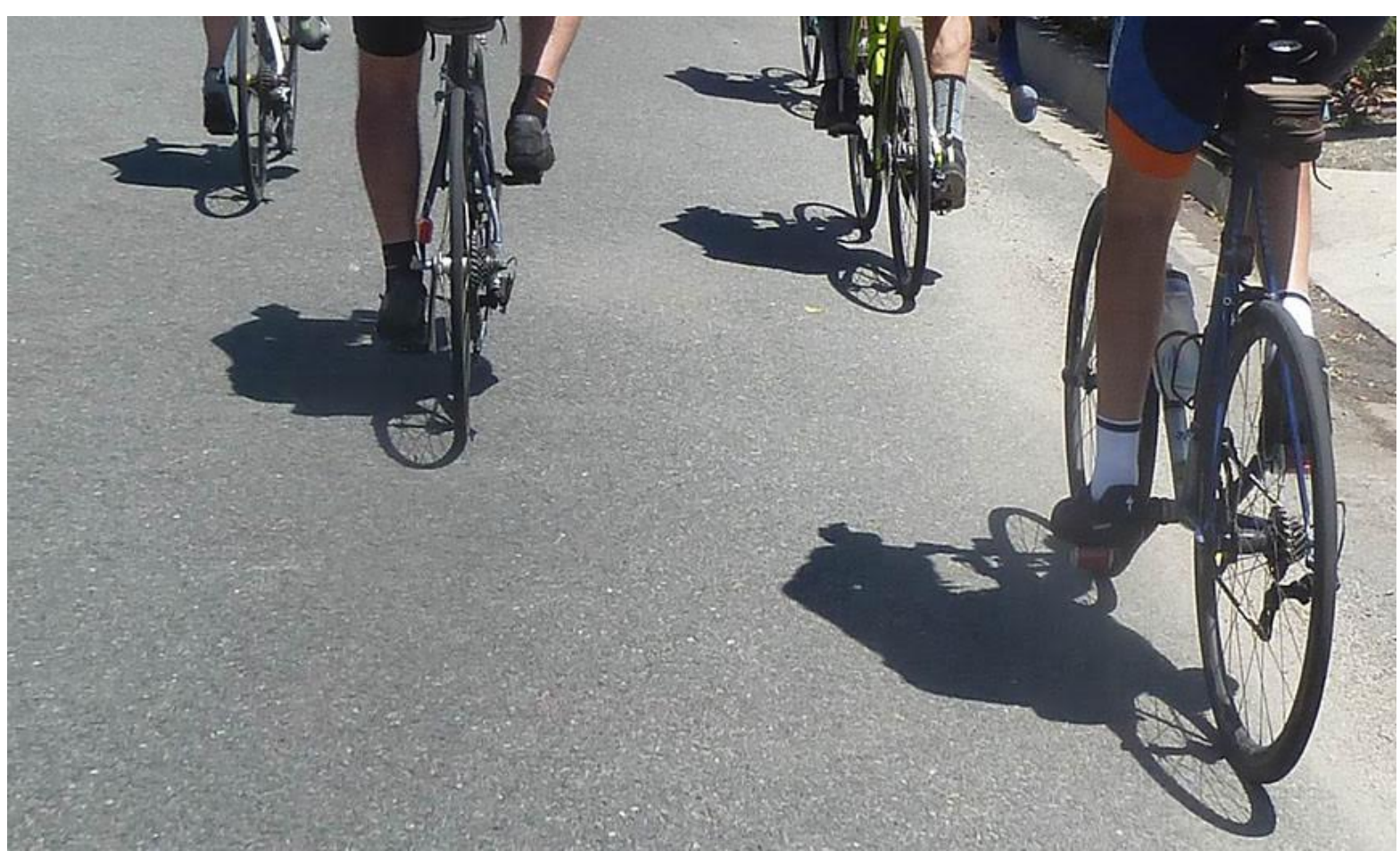
This Week: This Saturday is our 7th Grand Tour Trainer and also the Century and Metric Century of the month. We will be riding the "Dam Corner Century." This is basically the club's "Santa Fe Dam" ride but starting from the "Corner" in Beverly Hills rather than Monterey Park to increase the miles to a full century. The full century makes the same trip to the top of Lake Street I did just last Sunday, but I don't mind and since almost no one else did Sunday's ride, I guess no one else can complain. The metric century is a cut down version of the full century. It still goes to to the Dam, but by a