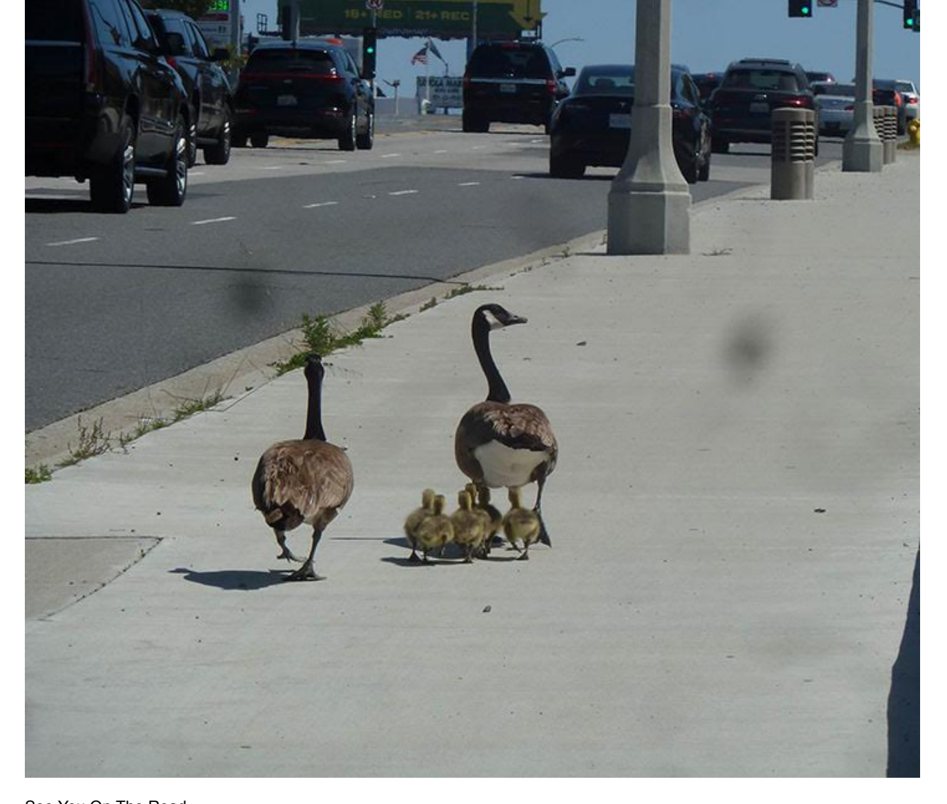
See You On The Road Rod Doty, VP