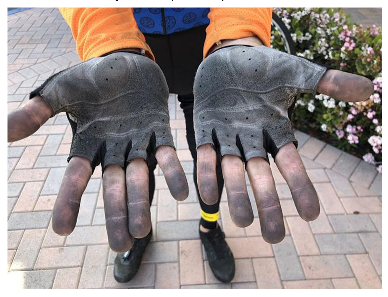
We stopped for ice cream about 1 mile from the end which made for a pleasant end to the ride.