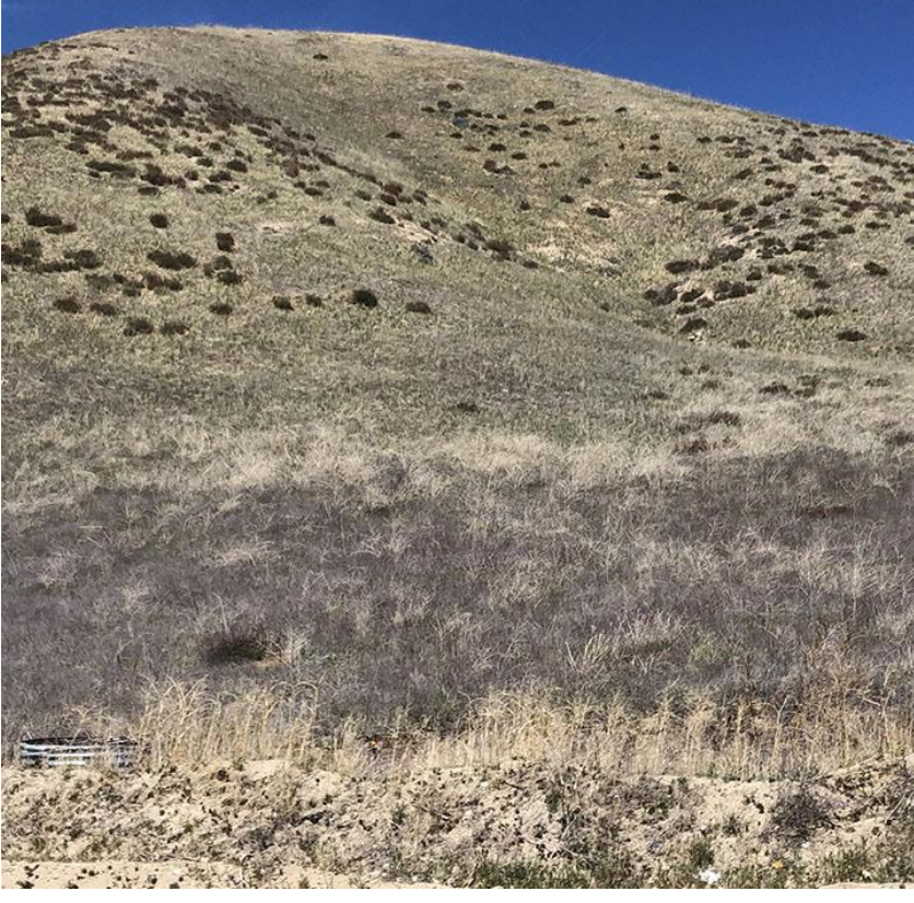
There were a few poppies. Gary took this shot of some: