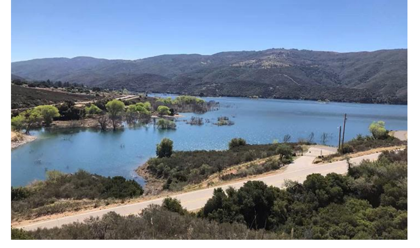
But this shot from Gary of Castaic Lake shows that it is down a bit from previous years.