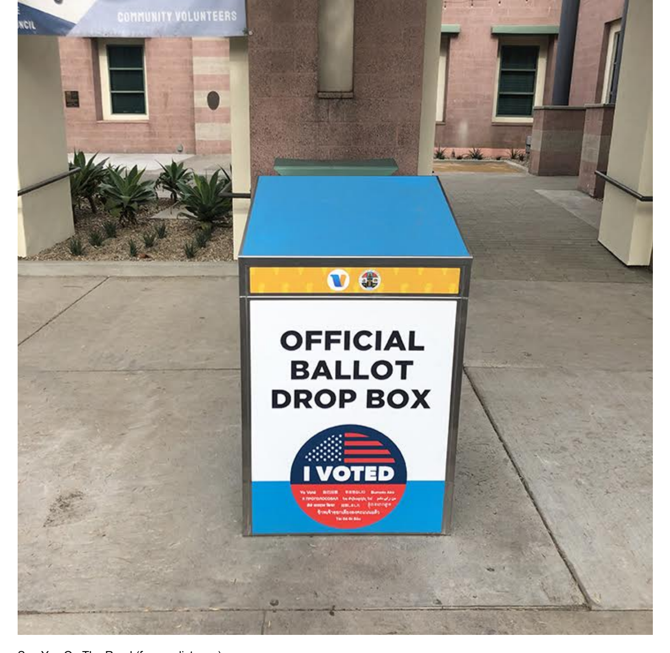
See You On The Road (from a distance)