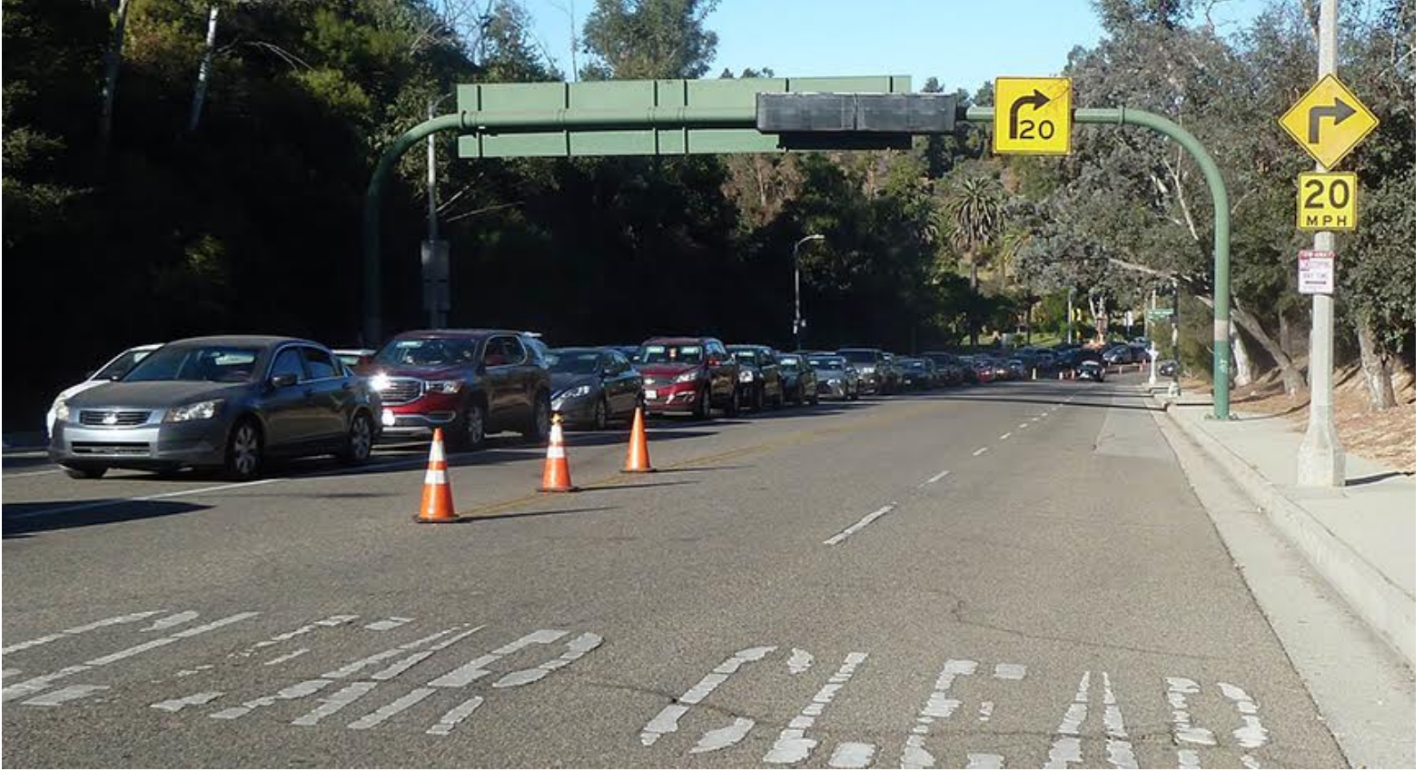
It appeared the testing site was not open yet. I took this photo of the site from the hills above the parking lot