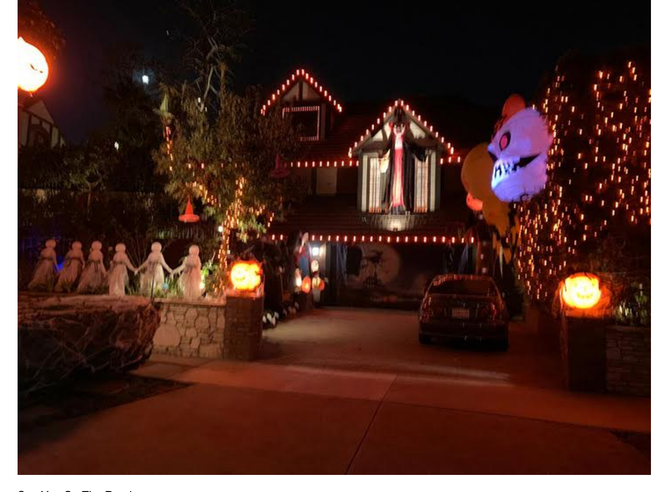
See You On The Road Rod Doty, VP