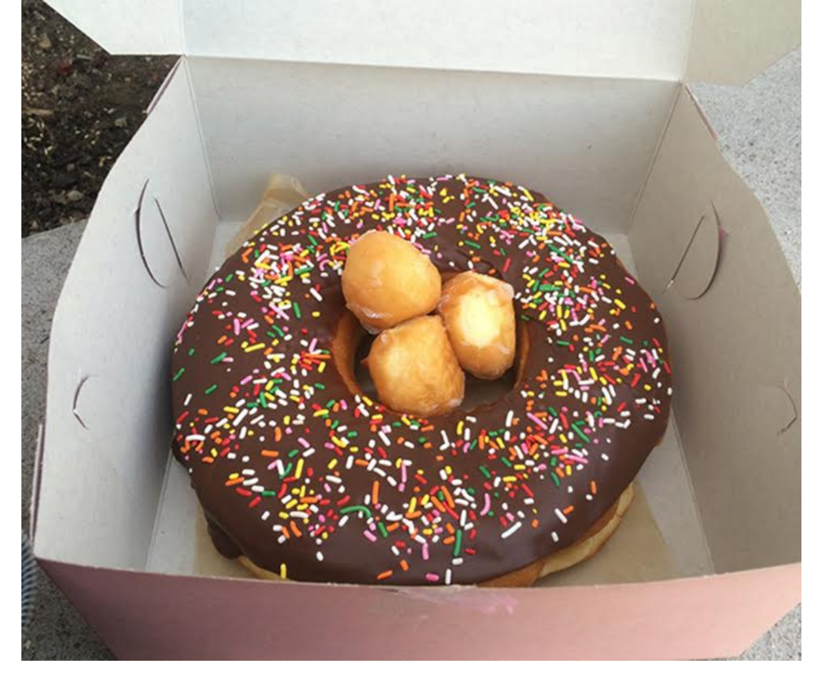
Other Rides: As usual of late, the Thursday Triple Dipper ride drew a good crowd. Phil sent me this photo: