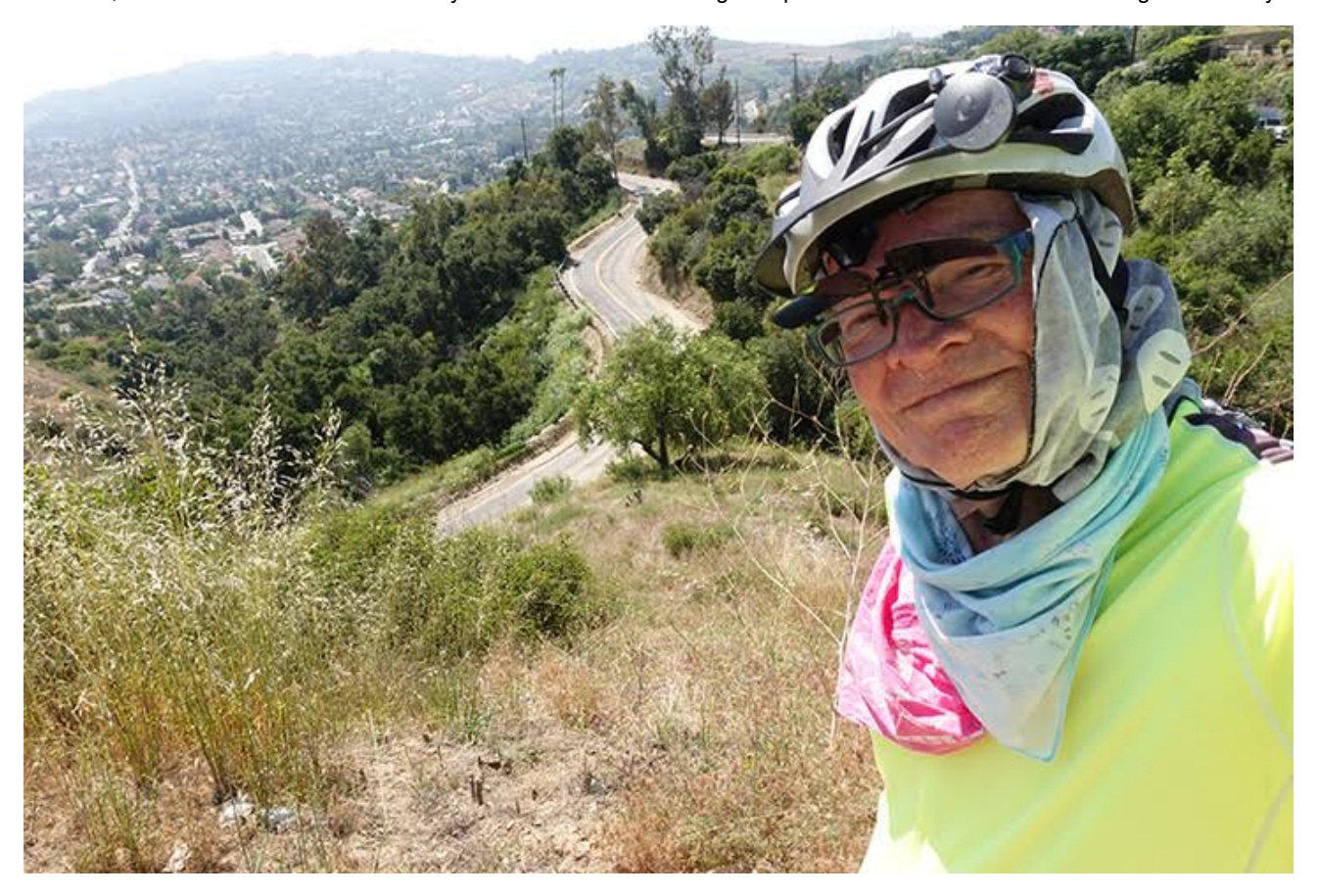
This Sunday: Speaking of which, this Sunday we will be riding "Valley Rally" which starts in Whittier and heads to points east. There are 4 routes. The long and medium go over Turnbull Canyon, but the long does it on the way back while the medium does it on the way out. Probably easier to do the main climb of the day early in the ride rather than near the end. The long also adds several other smaller climbs which the medium route misses. The two shorter routes travel around Turnbull rather than going over it. I don't know if Kit plans on being there again. You know it might be nice if we had a tradition of someone riding each route a week early so they could report any road problems etc.