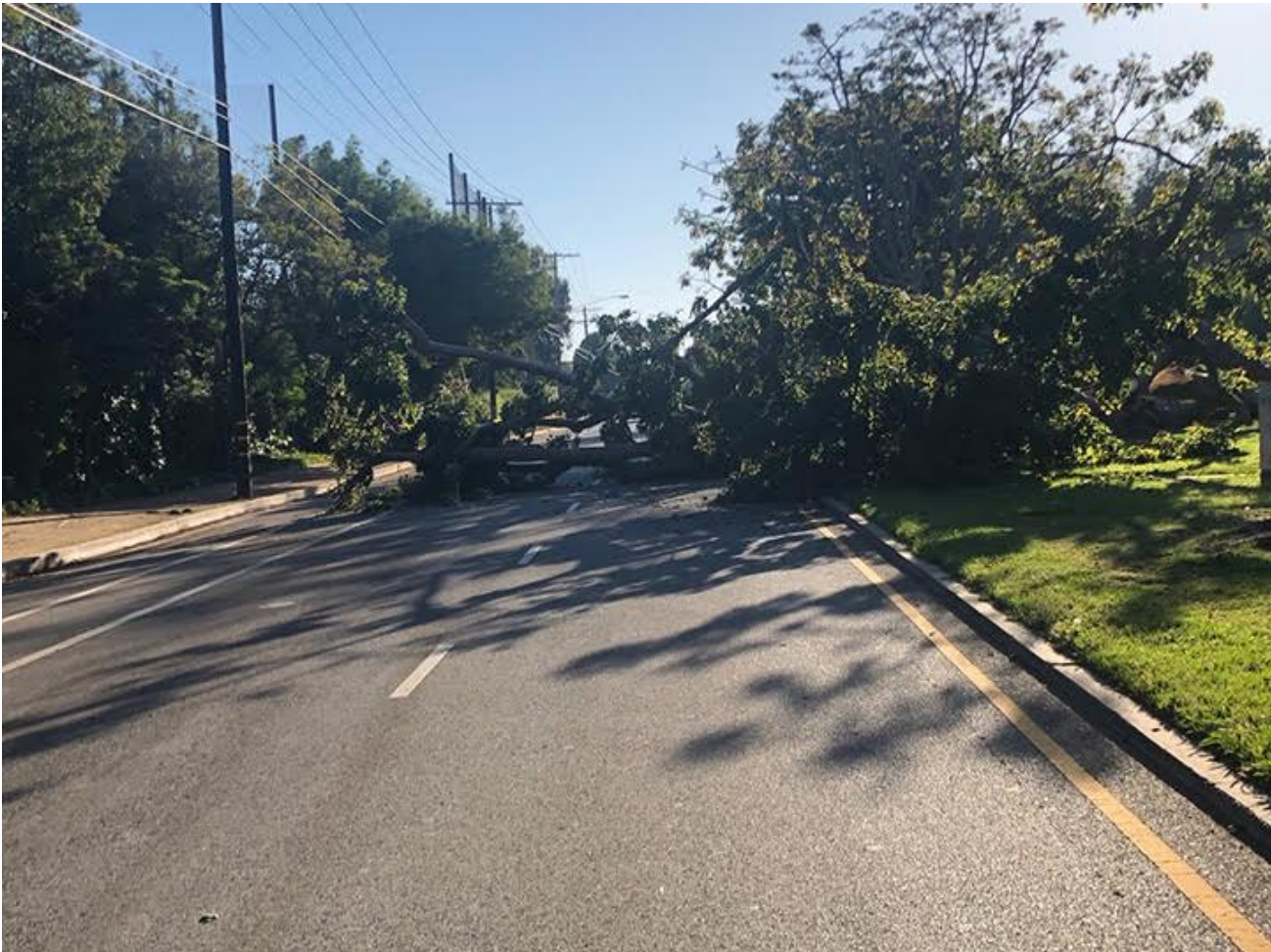
Maybe this is a new plan to keep cyclists and joggers from congregating along this street.