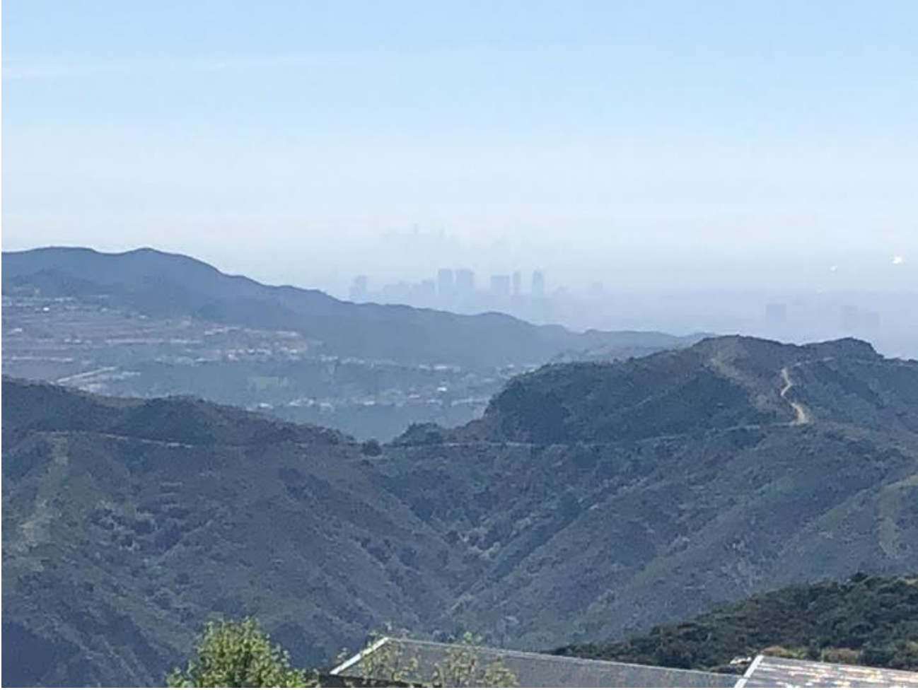
Mel also sent me this photo of San Vicente Blvd.: