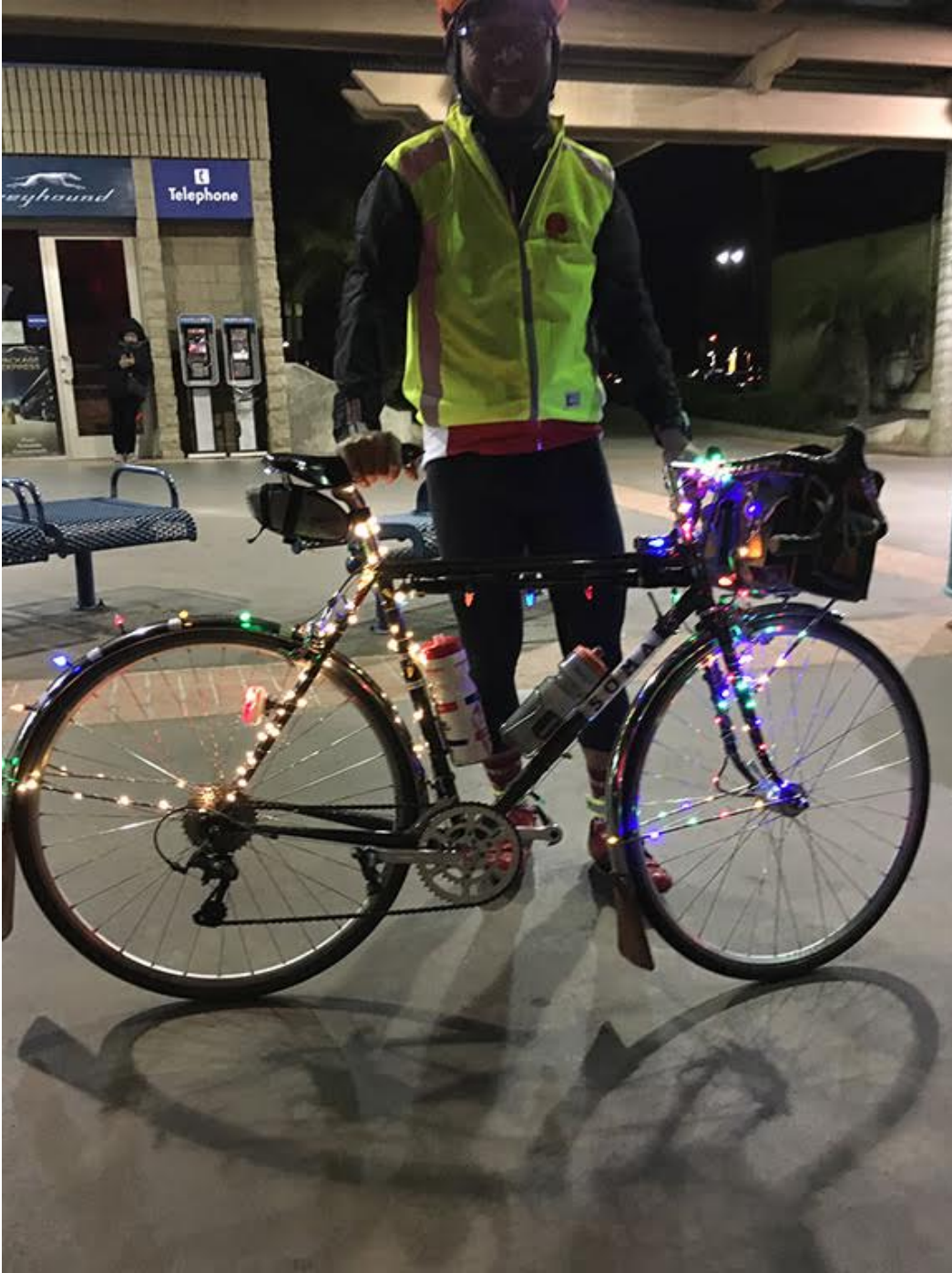
Parting Shot: I took this photo on a ride a couple of weeks ago.