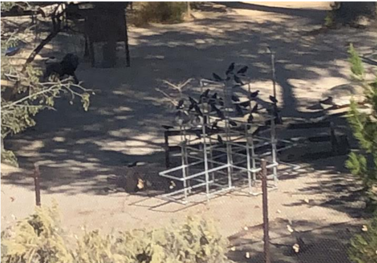
It's a jungle gym with a bunch of crows perched on it. It would appear to be a re-creation of a scene from Tippi Hedren's most famous movie -- "The Birds." The first time we saw it, I think we thought they were real birds, but since they are there every time we go by, I guess not.