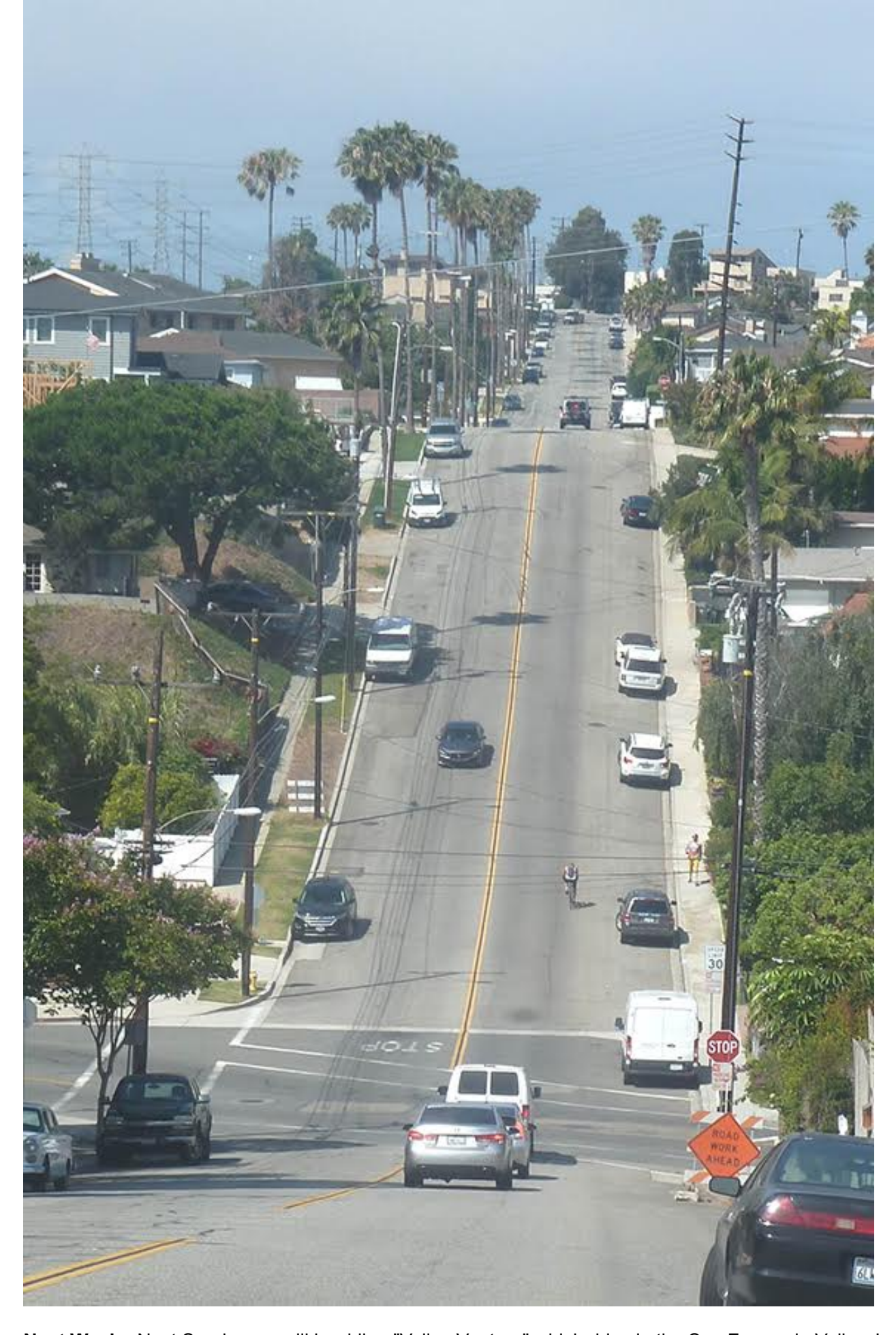
Next Week: Next Sunday we will be riding "Valley Venture" which rides in the San Fernando Valley. Long range forecasts look like it will be warm, but not excessively hot next Sunday, so we should be OK. The good news is that all the heavy climbing is in the beginning of the routes before it really gets warm. Speaking of climbing, the long has a few difficult climbs. The big feature of the day is the trip up Escalon/Encino Hills which is about 1 mile and may be one of the steeper hills in the