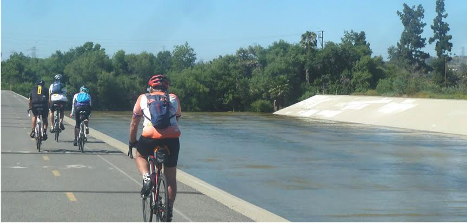
We all remarked about how much water was flowing in the Rio Hondo. This second photo shows this even better